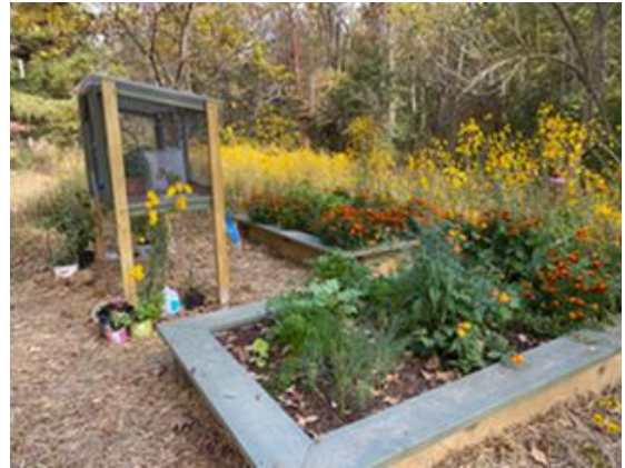
Jackson County Butterfly Park.