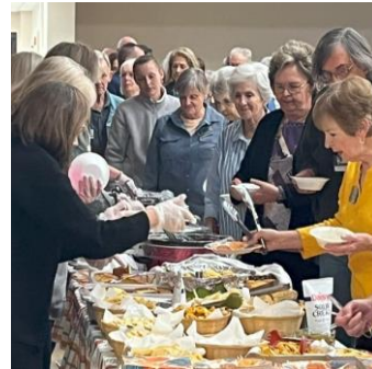
Lunch at gardening conference.