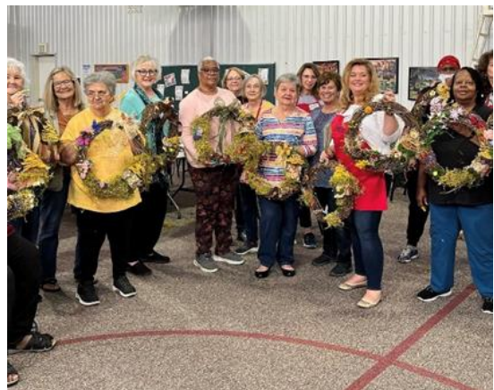
CAMGA and Wetumpka Seniors show off fairy wreaths they made.

In December, CAMGA members celebrated the holidays together at our annual Christmas party. Everyone enjoyed the delicious food, games and fellowship.