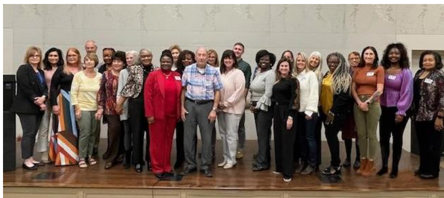
Jefferson County 2023 Graduates.