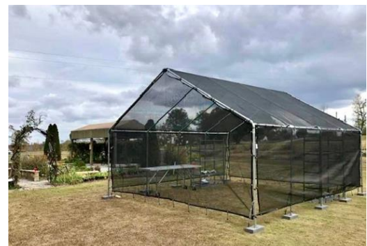
Shade Structure.

Also in November, the CCMGA gathered to assemble its new 18'x 20' steel framed Shade Structure, made possible by a submitted and awarded CAWACO grant. The new structure is located at the association's Demonstration Garden and will serve as a multi-use outdoor classroom, providing educational opportunities for the residents of our community. Closing out 2023, the CCMGA will have its annual Christmas luncheon and Gift Swap while making plans for a prosperous 2024!