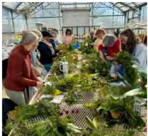
Wreath Class.

fun!!! Stay tuned for our monthly series, "Getting Dirty at the Library." Next year the topics will be very diverse ranging from Whooping Cranes to Pruning for Blooms and the Value of Oaks.