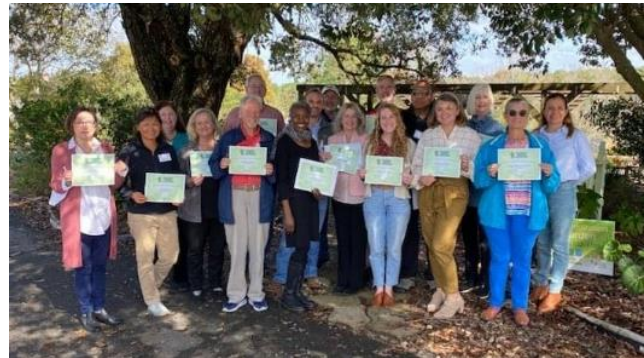
MCMG interns!

We are so proud of them! They are a wonderful addition to our Alabama Master Gardener family.