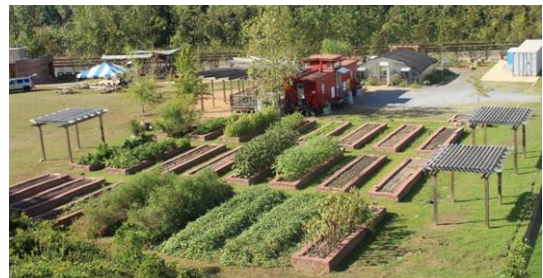
EAT South.

One of our projects, EAT South, under the direction of Janice Jackson and Henry Lucas, is Montgomery's Urban Teaching Farm and home to small farm animals, honey bees, wildlife, fresh fruits and vegetables. It includes a greenhouse, space for growing vegetables, fruit trees, an apiary, a chicken coop, a dye garden, and a compost system. Approximately 3000 children have learned about plants and healthy eating there. EAT South grows transplants and donates hundreds of plants to community gardens and CCMGA plant sales.