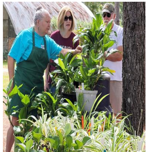
Master Gardener answering questions about plants.

classes, revising our bylaws, setting up a 12x15 greenhouse generously donated by one of our MGs, and mentoring our spring class of Interns! Needless to say, the Wiregrass stays busy!