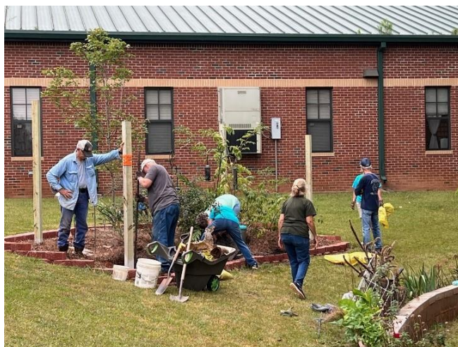
Workday at School of Blooms Bird Sanctuary.

Christmas blessings to you and yours, and may 2024 be all you need it to be.