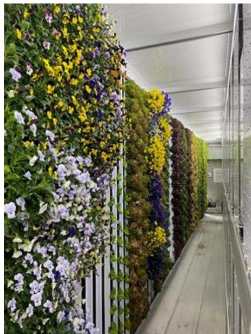
Vertical gardening display at Auburn University's Transformation Garden, Nov. 19, 2023.

planting flowers around a community gazebo for all to enjoy at their leisure. The AMGA lauded the Board and was awarded a $1,000 grant that was presented by the Dadeville City Council. Congratulations and thank you to the awesome MGs who shepherded this initiative!