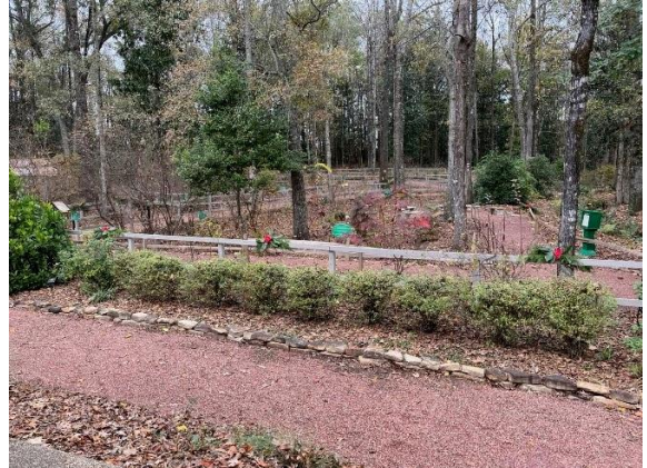
Caroline Dean Wildflower Trail.

Our fall social was held on the Roof Top Garden at AU's Culinary Science Center. Watching the sunset and viewing the beautiful plants was a wonderful treat.