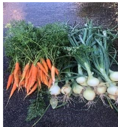
Harvest from ACMGA Demo Garden.