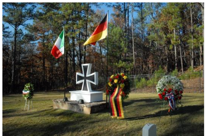
(L to R) The Italian, German and American Wreaths at the POW Cemetery on November 19, 2023.

We are planning for our 2024 Lunch and Learn Program from April through September. Our busy year concluded by installing Clubhouse holiday decorations, hosting certification of our latest intern class and conducting a fun holiday and awards dinner.