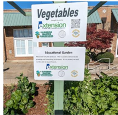
Example of signage placed at Education Garden.

The garden has won many compliments from both local employees and courthouse visitors.