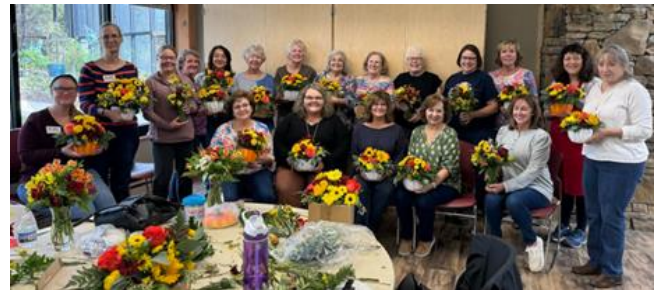
Participants enjoyed making beautiful fall floral arrangements at the Floral Workshop.

During Thanksgiving week members enjoyed participating in a floral arranging workshop. The Speaker's Bureau and the Habitat for Humanity crews continued to serve the Huntsville area by sharing their knowledge and their talents.